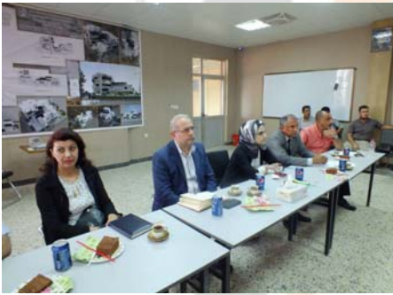
Side of discussions of the fifth stage

The university president joined some of these discussions, to present his support to the educational process in the various university's departments (and architectural department as one of them).