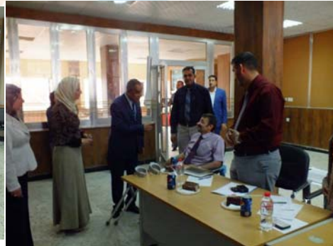
The presence of the department dean in the discussions of fifth stage projects