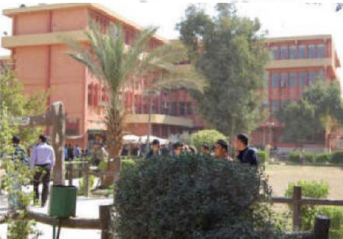
The department Building